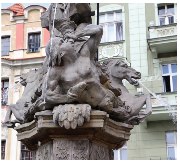
Fig. 10. A sculptural group of Neptune – a figure of Triton from the fountain in Świdnica

II. 9. Głowa delfina z wylewem na kłodzkiej fontannie