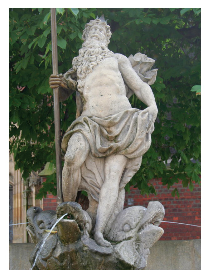
Fig. 7. Neptune's figure from the fountain in Legnica

Silesian fountains were modelled on those of Western Europe, probably to a large extent thanks to richly illustrated publications reaching Silesia. Particularly important for the popularisation of water fountains was an album of fountains of Rome and Frascati published in 1685 by