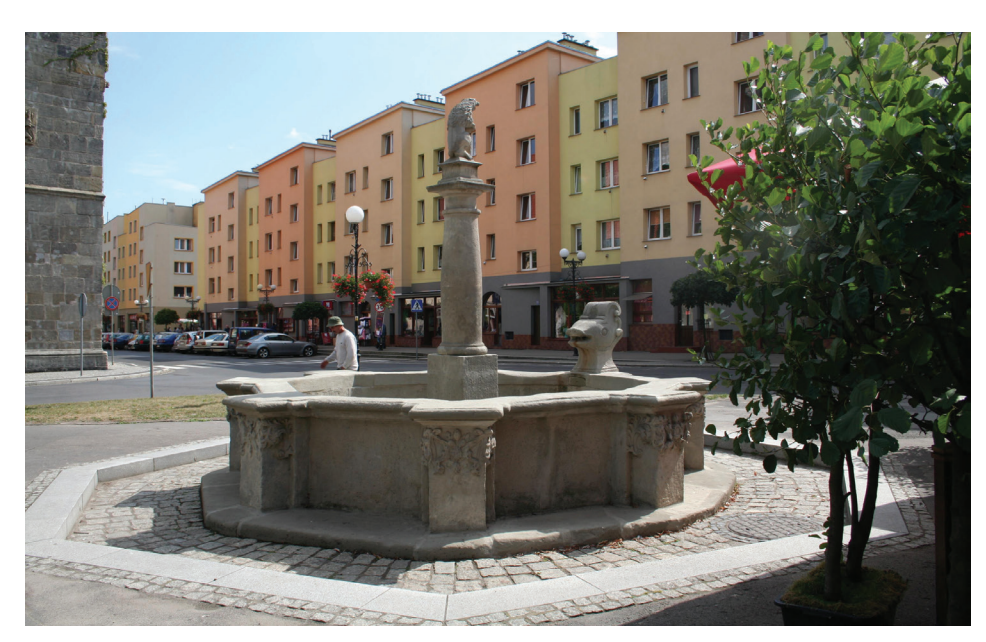
Fig. 3. Column with a lion in Lwówek Śląski (photo by B. Ludwig) II. 3. Kolumna z lwem w Lwówku Śląskim (fot. B. Ludwig)

in front of the town hall in Kłodzko was built at the turn of the 18<sup>th</sup> century on the site of an earlier well from the mid-16<sup>th</sup> century, supplied from the above-mentioned waterworks. It was an urban supplement to the renovation of the town hall carried out in 1696, rebuilt in new forms just after the Thirty Years' War (1653–1654) [2, pp. 17, 20, 108, 117], [20].