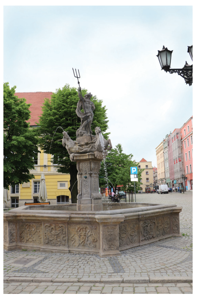
Fig. 6. Neptune's Fountain in the Market Square in Świdnica in a frontal view

of the market square was complemented with a Neptune Fountain, erected in the north-western corner of the square at the place of a Renaissance fountain with an analogous representation [6], [7], also the work of Weber completed in 1723<sup>5</sup> (Fig. 6). The first of them was a statue of St. John of Nepomuk and St. Florian at the corners of the town hall and the mid-market block. After several years, in 1740 and 1744, the next two water intakes at the corners of Świdnica's market square received new Baroque forms (one of them had already been transformed into a wooden fountain with a two-headed eagle) [7]. The oldest Baroque fountain in Wrocław was created at