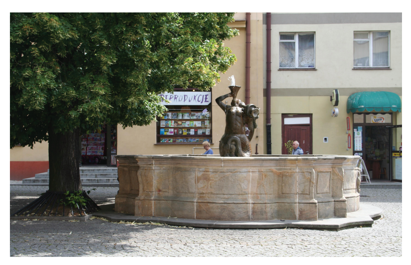
Fig. 8. The Siren Fountain in the Market Square in Legnica (photo by B. Ludwig) II. 8. Fontanna Syrenki na rynku w Legnicy (fot. B. Ludwig)

Il. 7. Figura Neptuna z legnickiej fontanny (fot. B. Ludwig)