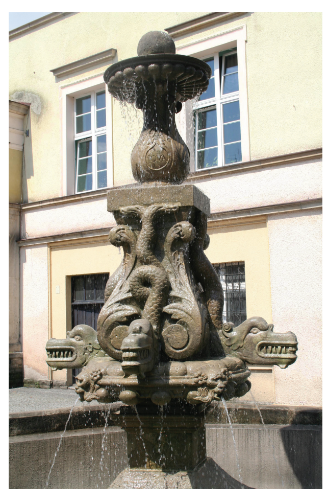
Fig. 1. The Dolphin Fountain in the Market Square in Złotoryja

II. 1. Fontanna Delfinów na rynku w Złotoryi