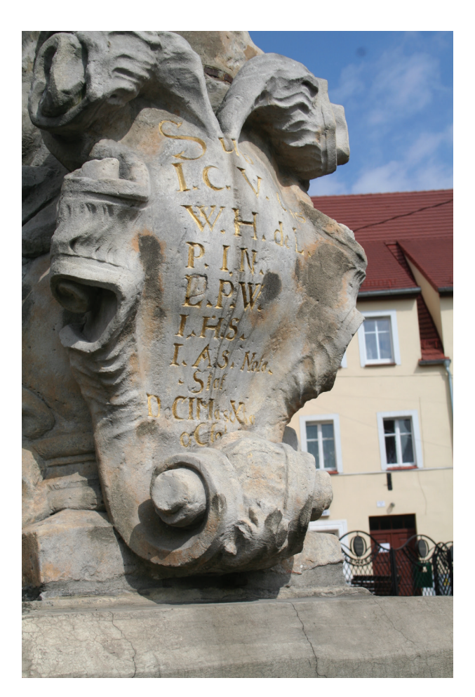
Fig. 11. The inscription cartouche of the fountain in Lubomierz

gens patrIa VIVe/ et fraVs hostILIs non MetVenDa tIbI" – 1696 [5], Lubomierz "Nota/Stat/ DeCIMa seXta/aCIes" - 1712 (Fig. 11), Świdnica "SVB/ CON. ET PROCONSV/ LATV IGNATII HE/NTZSHEL AVGVSTINI/ RIHERSBERG CARL/ NATVS PRAESIDIO IOSE /PHI WEIGEL SENATO/ RIBVS IN VIVISSTANTI/SVS GOTERI DO REH/LER JOANNE HEN/ET JOANNE ANTONIO/RESCHEL" - 1723 (Fig. 12) and "SVMPTI / CIVITATIS [HIC] EDIFI/CATVS ET ORNATVS/ EST/FONSISTE" – 1727). This confirms the commemorative significance of the foundation. The column of St. Maternus probably commemorates the sixtieth anniversary of the imperial certification of the Benedictine monastery's rights granted to Lubomierz and the surrounding area, verified by a document issued by J.A. Schaffgotsch in 1709, who may have co-founded the monument (I.A.S. in the inscription). The inscription on the Neptune Fountain in Świdnica probably mentioned Christoph Leopold Schaffgotsch on the 20th anniversary of his death. Other dates are currently not so clear. The foundation of the Atlas Fountain in Świdnica may have had something to do with the establishment of the Commercial College in Wrocław in the same year, 1716, which dealt with manufacturing and trade in the province. Its activities were