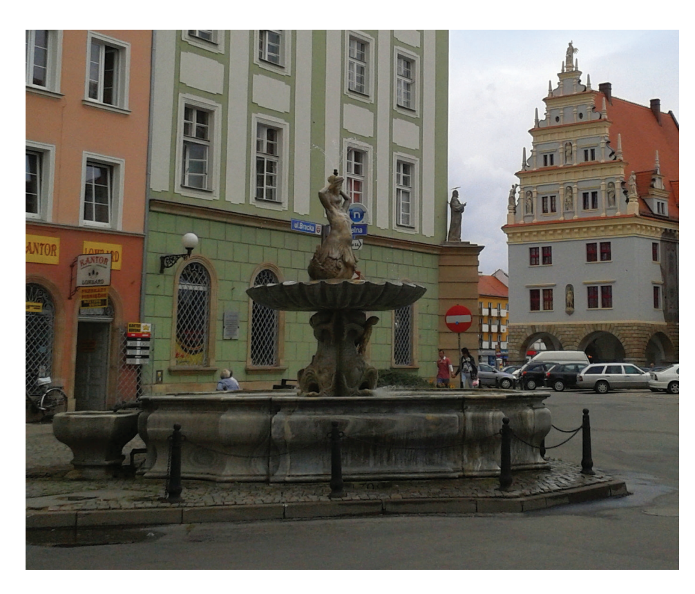
Fig. 2. The Triton Fountain in Nysa. View towards the Market Square

Half a century after the end of the Thirty Years' War, the towns achieved a certain prosperity. During this time functional needs were secured, destroyed houses were rebuilt, and it was possible to start decorating city streets and squares. In Prudnik, revived after the war fires, the mayor and five councillors founded a fountain in 1696, which stood in the north-western corner of the town square, replacing the medieval well [5]. The fountain with the lion