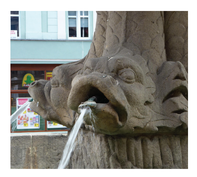
Fig. 9. Head of a dolphin with a spout on a fountain in Kłodzko

II. 9. Głowa delfina z wylewem na kłodzkiej fontannie