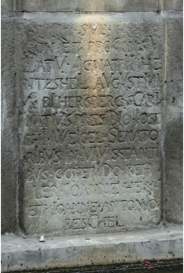
Fig. 12. Foundation plaque on the shaft of Neptune's Fountain in Świdnica

II. 12. Tablica fundacyjna na trzonie fontanny Neptuna w Świdnicy