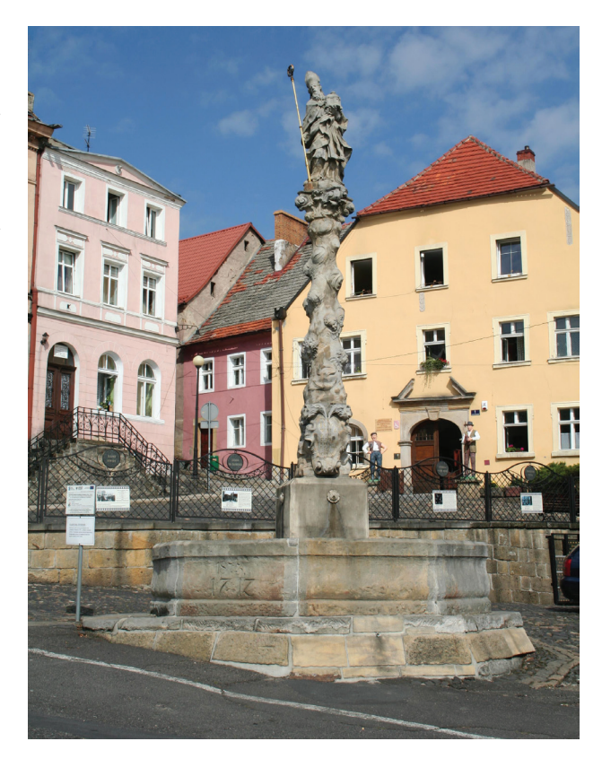
Fig. 4. Column of St. Maternus in Lubomierz II. 4. Kolumna św. Maternusa w Lubomierzu

A similar arrangement of the market square with fountains as in Lwówek Śląski was given to Świdnica. However, the final effect due to the quality of the sculptural works was definitely more impressive. It was not until the end of the 17<sup>th</sup> century that the Świdnica market square started to be enriched with numerous Baroque objects of small architecture. The first one was the Holy Trinity Column (or rather the Throne of Grace) founded by J.J.M. Sinzendorf and erected in 1693, which was a testimony to the founder's faith. Then, after the fire of 1716, in which the town hall also suffered, the brewers' guild paid for the construction of a new water supply system from the springs in Witoszów, ending with a water intake in the square. It was given the form of the Atlas