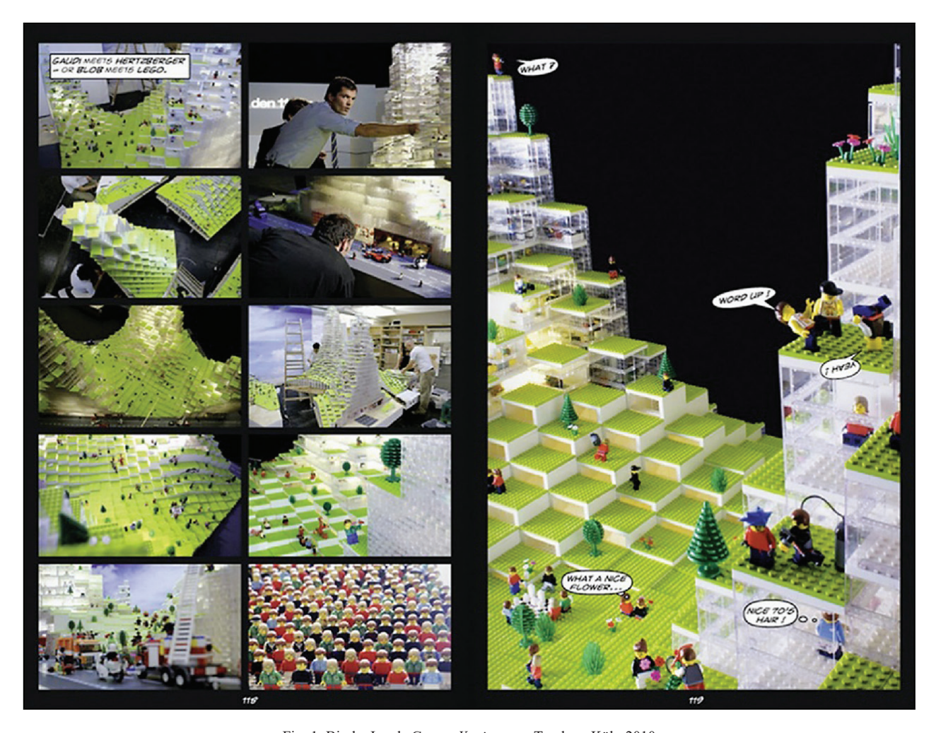
Fig. 1. Bjarke Ingels Group, Yes is more, Taschen, Köln 2010II. 1. Bjarke Ingels Group, Yes is more, Taschen, Kolonia 2010

its announcement grew<sup>4</sup>. This episode revealed the necessity of transmitting energy pulsating in the background of emerging projects, recording migrating ideas and growing structures taking shape of this architectural evolution. The necessity to show how the idea crystallizes, even though it is based on often wasted effort or even "fossils of past evolution", was revealed.