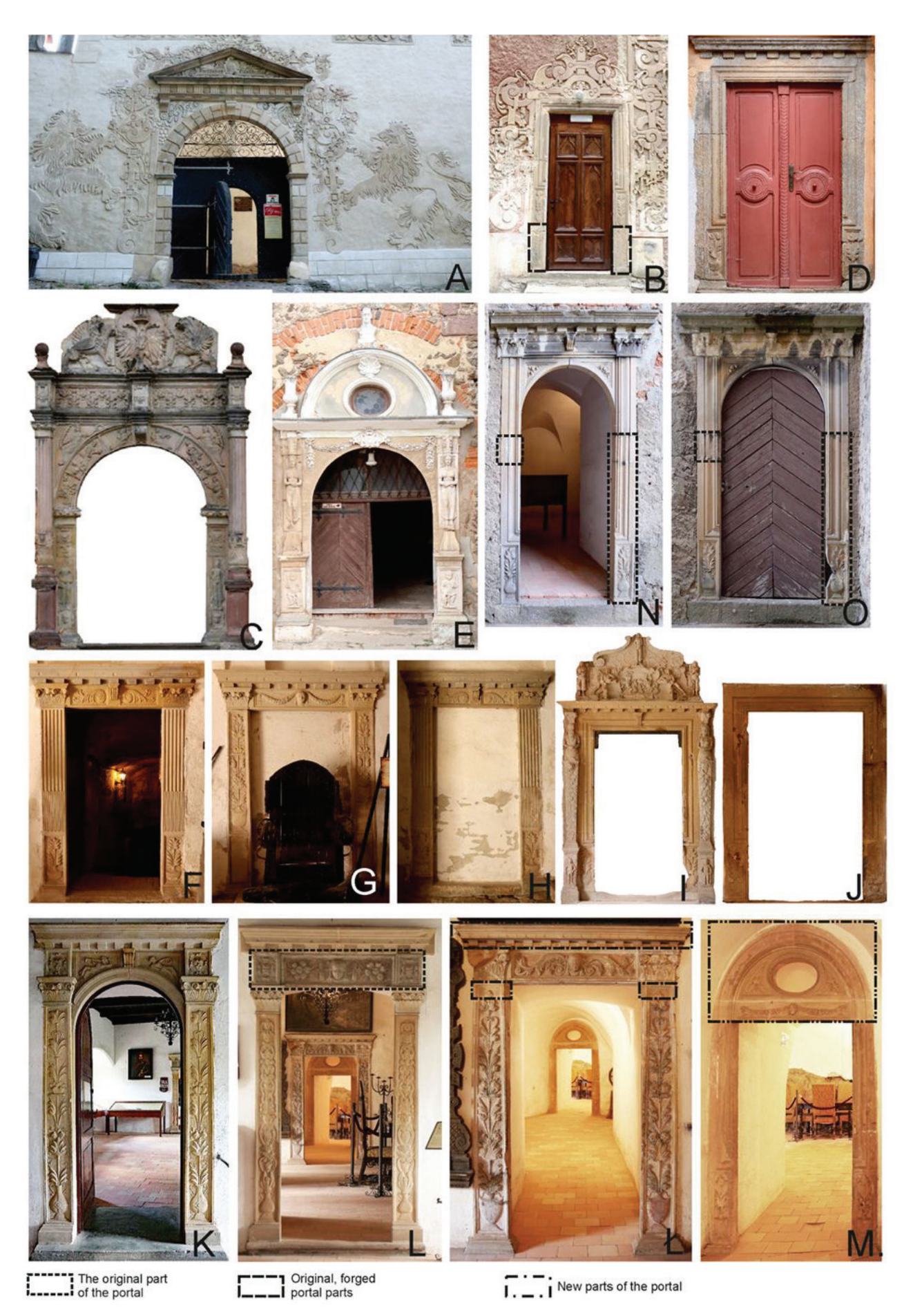
Fig. 1. List of the analysed portals (elaborated by T. Dziedzic)II. 1. Zestawienie analizowanych portali (oprac. T. Dziedzic)