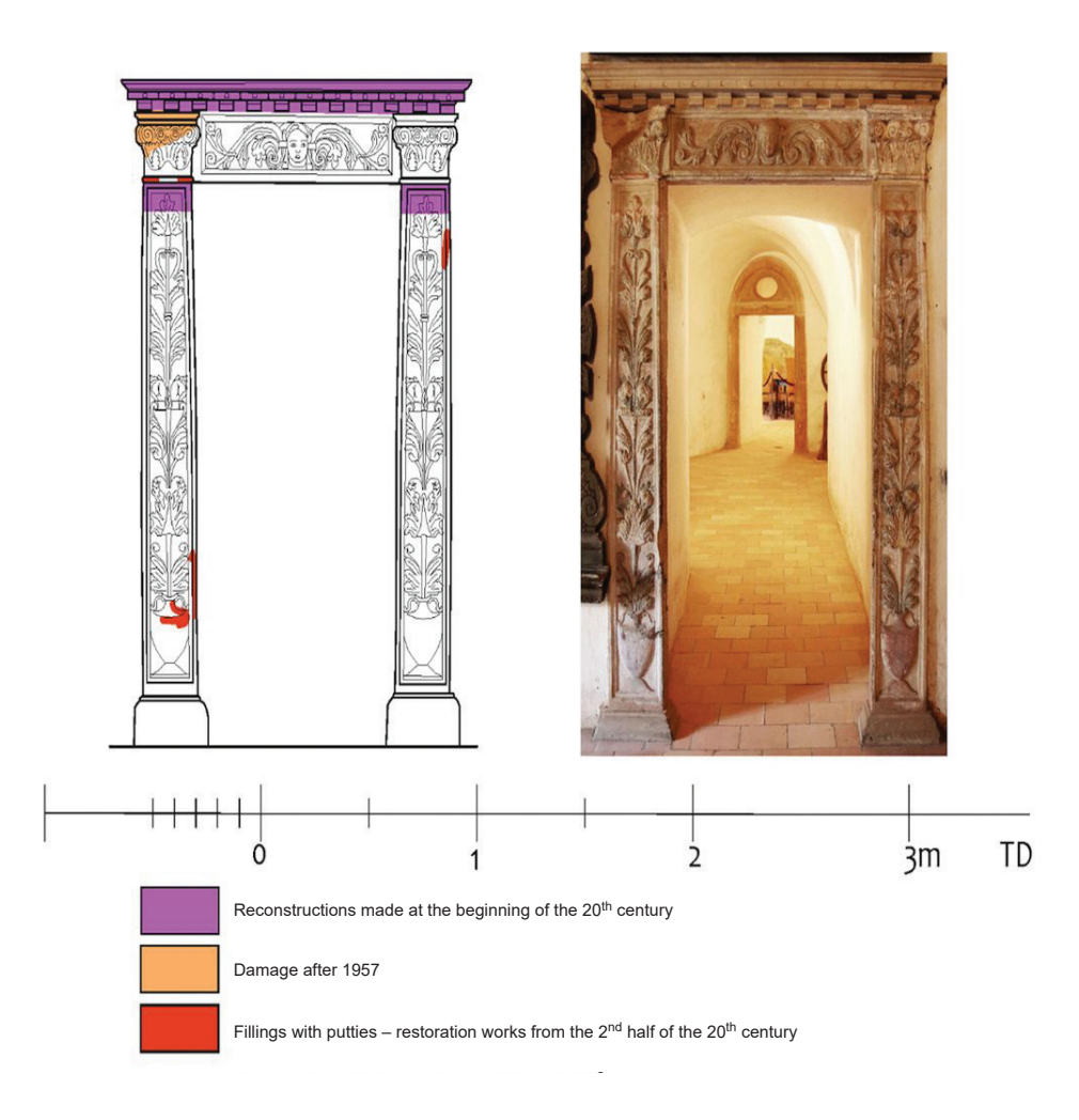
Fig. 4. Renaissance portal on the 1<sup>st</sup> floor of the upper castle. Inventory of the existing condition and conservation analysis of the portal with a woman's mask between garlands (drawing by T. Dziedzic, photo by A. Gryglewska, 2020) II. 4. Renesansowy portal na 1. piętrze górnego

na 1. piętrze górnego zamku. Inwentaryzacja stanu istniejącego i analiza konserwatorska portalu z maską kobiety między girlandami (rys. T. Dziedzic, fot. A. Gryglewska, 2020)