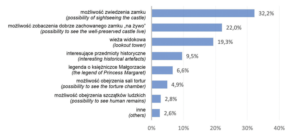
Fig. 5. Motivations of visitors to Grodno Castle in Zagórze Śląskie – pull factors (elaborated by A. Chlebicz)

II. 5. Charakterystyka motywacji odwiedzających zamek Grodno w Zagórzu Śląskim – czynniki pull (oprac. A. Chlebicz)