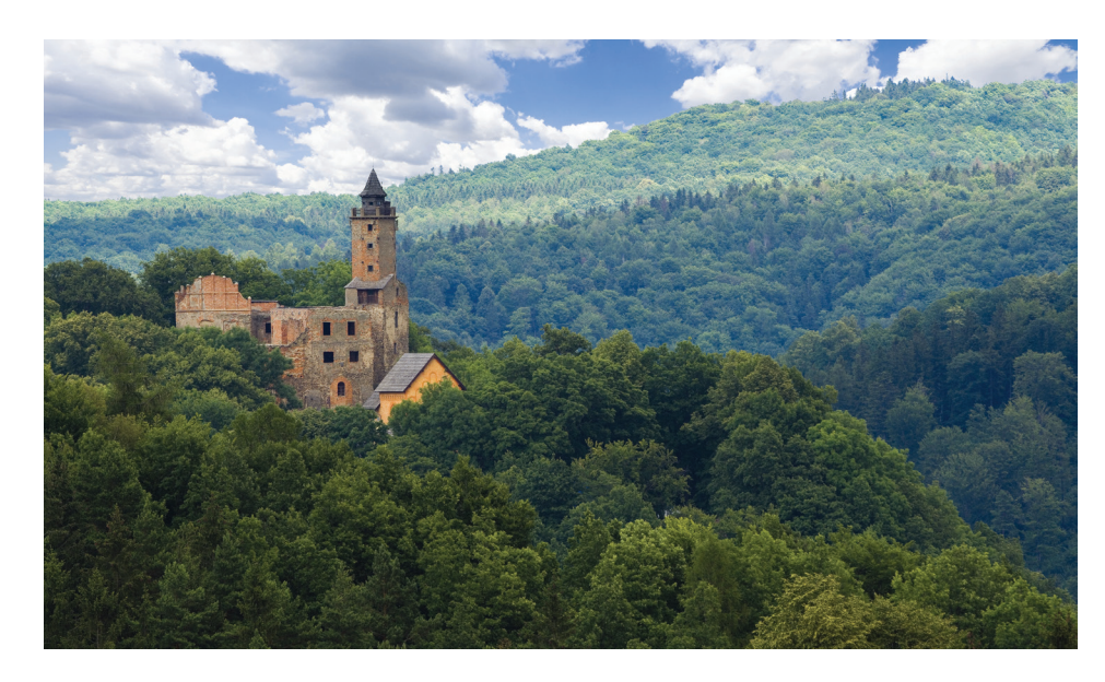
Fig. 1. Grodno Castle in Zagórze Śląskie II. 1. Zamek Grodno w Zagórzu Śląskim

financially. Włodzimierz Kurek (as cited in [7]), on the other hand, points out that leisure tourism revolving around luxury hotels is currently being pushed aside by a type of tourism that encourages deepening of knowledge, emotional development, physical activities and excitement.