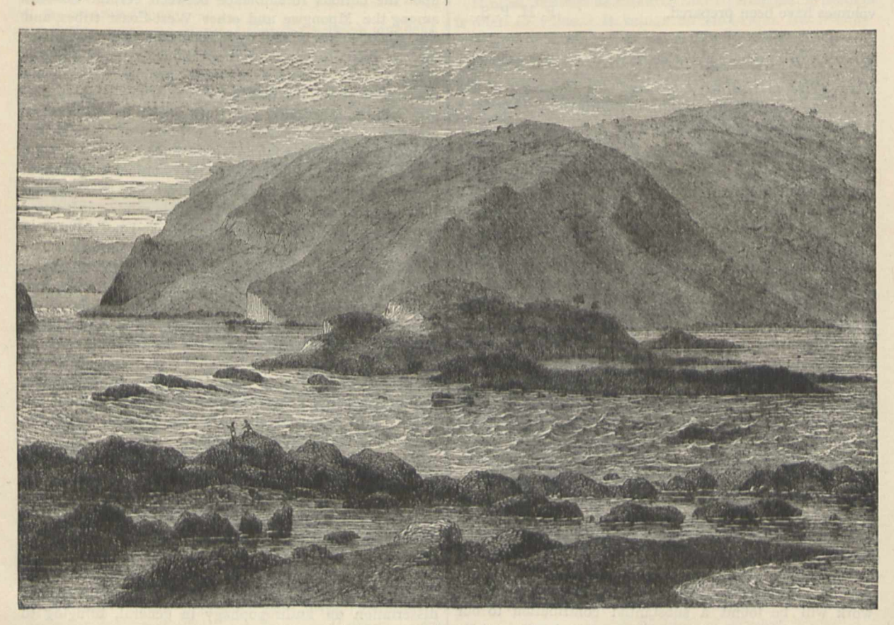
The Yellala (rapids) of the Congo River.

The chief interest of the second volume is connected with the Congo river, up which Burton journeyed as far as the Yellala, or rapids, which he calculates to be between 116 and 117 miles from the mouth, the total fall in that distance being 390 feet, of which 195 feet occurs between the Yellala and Boma, 64 miles. From the Great Rapids to the Vivi or lowest rapids, a distance of five miles, the fall is 100 feet. Some important facts are given as