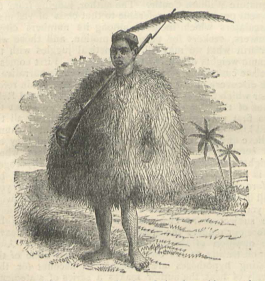
Fetish boy (Congo district), showing dress during the novitiate at puberty.

On his way to the rapids he was detained for some time at the village Banza Nokki, near one of the upper reaches of the river, and of course took the opportunity of studying the people, who seem to have been but little affected by the labours of the Portuguese missionaries who lived among them for so many generations. The district Burton describes as a perfect paradise, the country lovely, and the climate all that can be desired. Very full details are given as to the ways of life of the people, their various customs, their superstitions, their language, &c. After the usual vexatious delays, Capt. Burton was able at last to set out on Sept. 16 for the cataracts of the Congo. These and their surroundings, the character of the country on the river banks and of the people dwelling near, are described in his usual graphic style, and with consider-