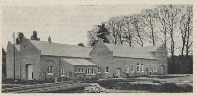
FIG. I.-New Buildings of the National Physical Laboratory.

The remainder of the new building is intended for photometry. On the ground floor is a large room for life-