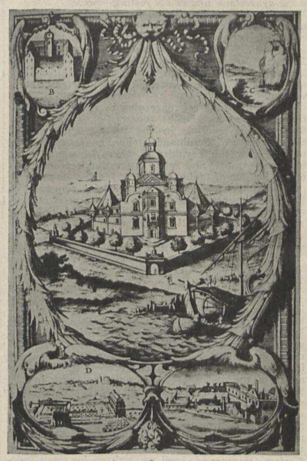
Tycho Brahe's Observatories. A, On the island Hveen (Uranienberg); n, in Wandsbeck; c, in Benatek; D, in Prague (Ferdinandeum); E, in Prague (Curtius's House).

THE Astronomical Observatory of Prague, like many other similar institutions which might be mentioned, has its work considerably restricted by the fact that the city in which it is situated has