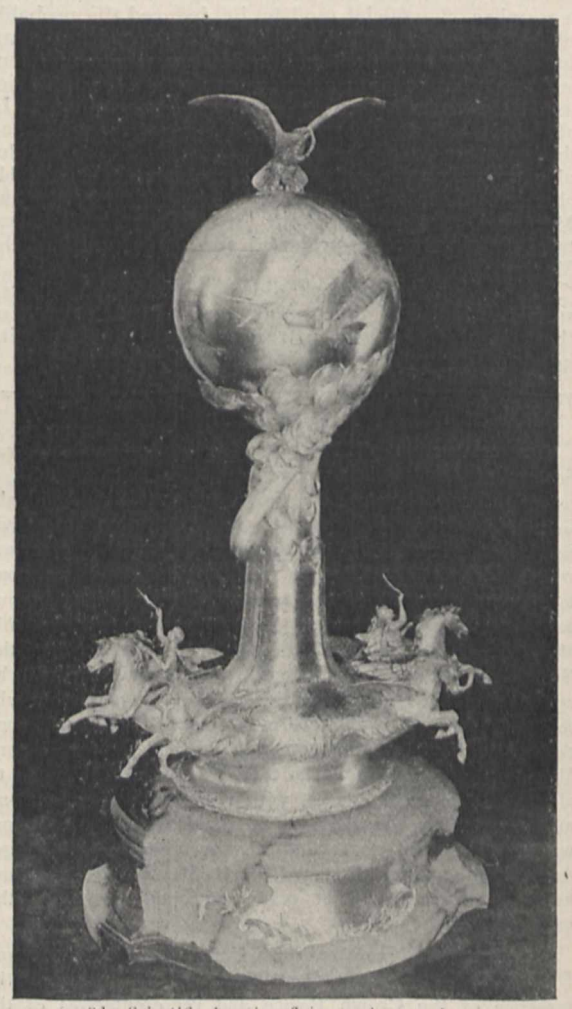
The Scientific American flying machine trophy.

THE trophy shown in the accompanying illustration is offered by the Scientific American for competition for heavier-than-air flying machines. In order that the com-