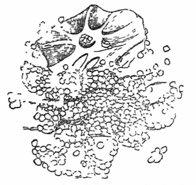
FIG. 1.-Section of Cocoa-Nib as seen under the microscope

of the commonest and worst description. If people would only trouble themselves to think that cocoa-nibs, which are simply the roasted seeds without any preparation, are retailed at 1s. 4d. per lb., how can they expect to obtain an equally genuine article in a finely-pulverised state, and packed in tinfoil and a showy outward cover, at the same price? which is what the so-called 'Homœopathic" and similarly prepared cocoas are sold at. Expensive machinery in the first place, and the constant wear and tear of the same, the consumption of fuel in the steam apparatus, and the expense of packing, have all to be paid for by the con-