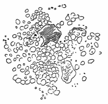
FIG. 3.-Microscopical appearance of "Cocoa Essence"

Until within the last few years, all these powdered cocoas were more or less "prepared," so that pure cocoa could not be obtained in this convenient form. An article, called "Cocoa Essence," recently introduced, has, however, dispelled this notion. We all know that the cocoa-seed naturally contains a large quantity of butter or fat (about 50 per cent.) which makes it too rich or heavy a beverage for many persons, and this more especially when we consider that other elements of nutrition, such as albumen, are also present. To deprive it entirely of its butter would be to take away one of its valuable principles; but it is possible to have too much of a good thing ; therefore, by taking away about two-thirds of the butter the cocoa itself is not only improved in a dietetical point of view, but the addition of sugar, arrowroot, &c., is rendered unnecessary to take up or balance the fatty portion. Those who wish for pure cocoa in a convenient form should therefore obtain the "Cocoa Essence." It is sold in 302. packets at 6d. each. A small spoonful is sufficient for one cup, and, unlike the "Homœopathic," "Soluble," and other similar cocoas, it is not mixed with milk, but with a little boiling water, and stirred for a second or two until it is