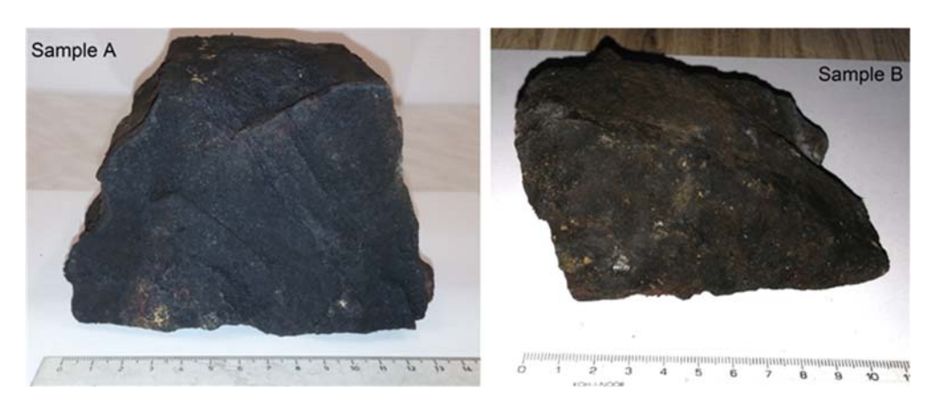
Fig. 1. Pieces of waste materials prepared for the tank test

Materials . The material applied consisted of furnace slag from a rotational kiln originating from lead refinery section in a zinc works. The waste took the form of crushed irregular lumps. In the leaching test, two such lumps (samples A and B) were used (Fig. 1). Each sample was weighed and measured by the print paper method. Weights of samples were as follows: A-3374 g, and B-975 g. The surface areas of samples were 0.0509 m<sup>2</sup> (sample A) and 0.0216 m<sup>2</sup> (sample B). The volume of each sample was calculated in order to ensure that adequate volume of leachant (2–5 volumes of the sample) used in the test.