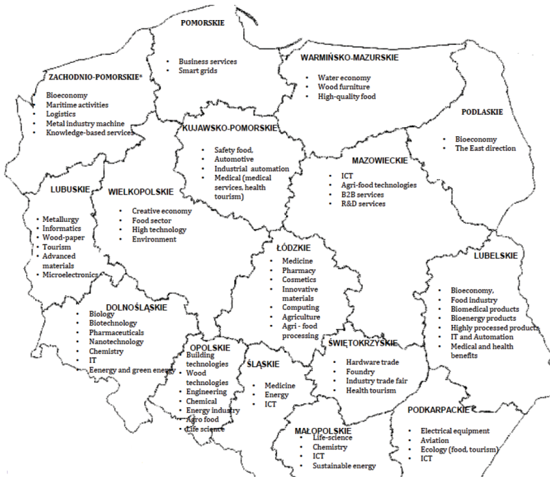
Figure 2. Regional Smart Specialisations in Poland